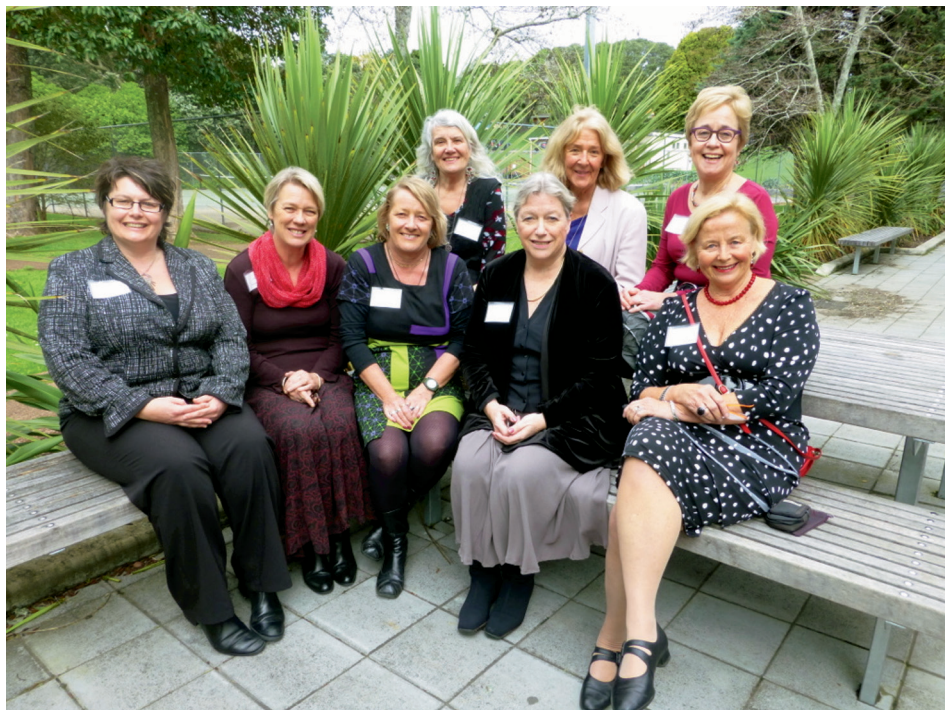
Members of the Cartwright Collective at a one-day conference, in 2013

My research revealed a profoundly unsatisfactory legal and ethical situation. Despite a consensus among bioethicists that society owes an ethical obligation to